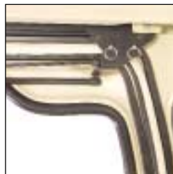
Inside top door