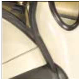
Front corner panel