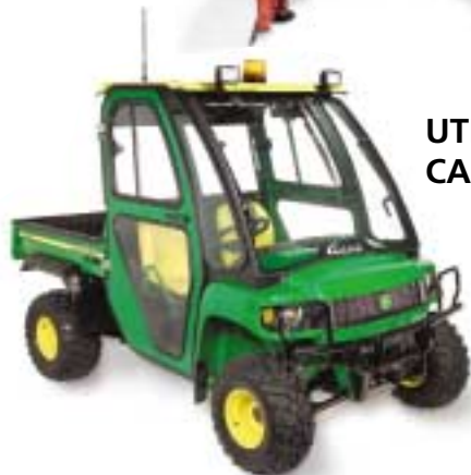
UTILITY VEHICLE CAB SYSTEMS